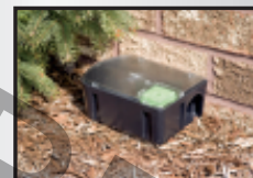
EXTERIOR OF HOMES

Must adhere to the USE RESTRICTIONS in the DIRECTIONS FOR USE section of this label.